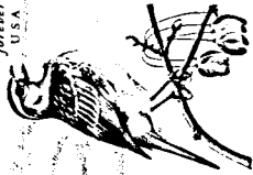
White-Throated Sparrow 394

WV Secretary of State Building 3, Suite 157-K 1900 Kanawha Blvd. E. Charleston, WV 25305