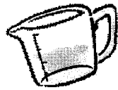
\frac{1}{4} cup bleach

Add \frac{1}{4} cup bleach to 1 gallon of water: