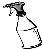
1 quart of cool water