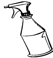
1 quart of cool water