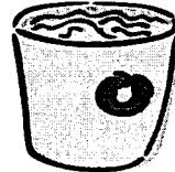
1 gallon of cool water