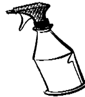
1 quart of cool water